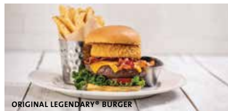
ORIGINAL LEGENDARY® BURGER