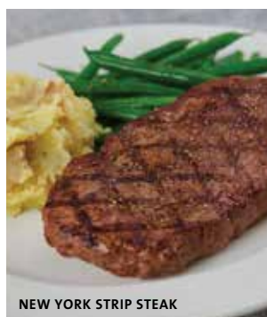
NEW YORK STRIP STEAK