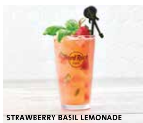
STRAWBERRY BASIL LEMONADE